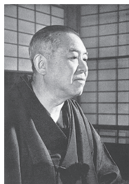
Fig. 1: Junichiro Tanizaki - circa 1940s